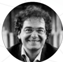
RUDY AERNOUDT Chief Economist European Commission