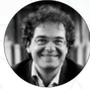
RUDY AERNOUDT Chief Economist European Commission