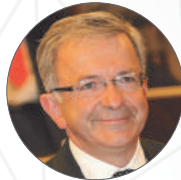
FRANÇOIS BONNEAU Président de la Région Centre-Val de Loire